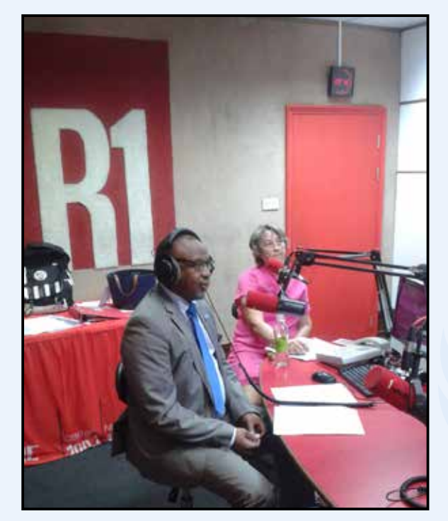
Figure 8 Dr L. Musango, WHO Representative in Mauritius doing a live radio show on the occasion of World Diabetes Day 2017