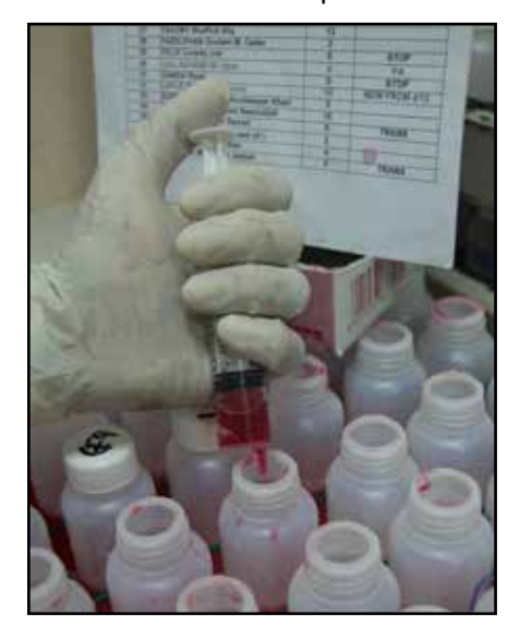
Figure 9 Mauritius implemented the strategy of methadone substitution therapy to reduce HIV transmission among PWID

As of December 2017, out of 5788 PLHIV (4230 males, 1558 females), 4884 PLHIV were enrolled in care with the MOHQL. 3602 adults and children were receiving Anti-Retroviral Therapy (ART) representing 62.3% of all adults and children living with HIV. As the implementation of the WHO 2015 Clinical Guidelines and the WHO test and treat recommendation progresses, the number of PLHIV on ART is expected to increase significantly. The percentage of pregnant women who are HIV positive receiving antiretroviral treatment to prevent mother-to-child transmission has improved from 68% in 2009 to 96.3% in 2017 with the prevalence of HIV among pregnant women remaining under 1%.