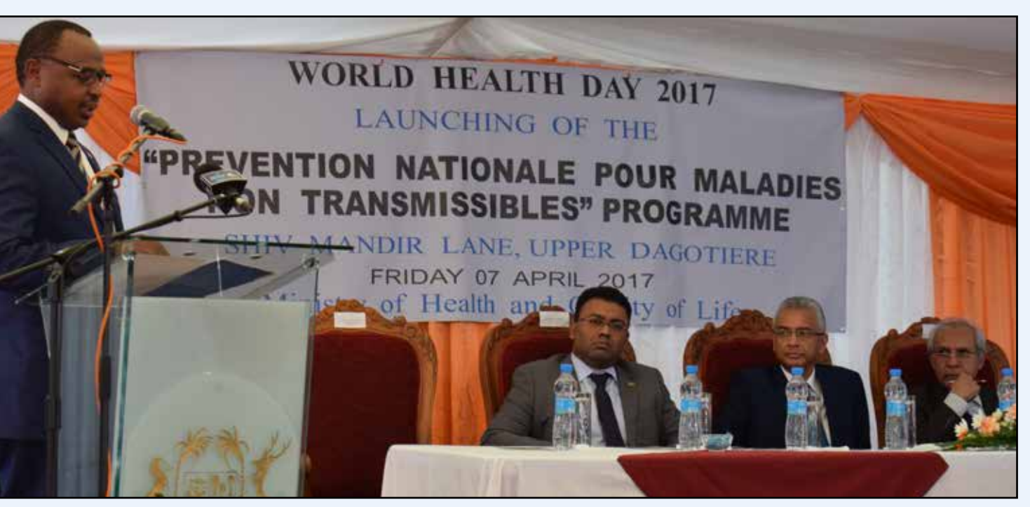
Figure 2 Dr L. Musango, WHO Representative in Mauritius addressing the audience in presence of Hon. Pravind Jugnauth, the Prime Minister of the Republic of Mauritius during the launching of activities in the context of the World Health Day 2017