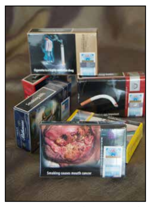
Figure 16 Mauritius shared its experiences in the implementation of the pictorial health warnings with the other African countries during a regional meeting held in Mauritius

Mauritius was host to the Africa Meeting on pictorial health warnings in June 2017, with participation from civil societies and health ministries representing 25 African countries. Mauritius was among 6 of the 47 African countries which have fully implemented the graphic health warnings and hence shared its experiences of implementation of the graphic health warnings on cigarette packages in the country in 2009. The cost-effectiveness of this powerful WHO FCTC measure in eliminating the tobacco industry's influence was highlighted by the speakers and the facilitators from the WHO AFRO. The strong tobacco control policies implemented so far in Mauritius include the promulgation of the Public Health (Restrictions on Tobacco Products) Regulations 2008. The scope of the legislation covers the following major tobacco control provisions: ban of smoking in public places, ban on sale of single sticks and the ban of advertising, promotion and sponsorship. These tobacco control measures brought a decrease in the number of cigarette sticks imported, from 1,306,406,000 in 2009 to 857,960,000 in 2016.