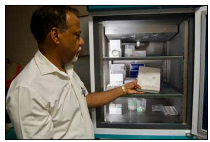
Figure 17 WHO Mauritius supporting the cold chain strengthening through the provision of refrigerators for vaccines storage

"Prevention offers the most cost-effective long-term strategy for the control of cervical cancer. The Government of Mauritius is committed to provide a safe and healthy environment to all Mauritian children and a strong foundation for their physical, emotional, mental and social development' Mrs Leela Devi Dookun-Luchoomun, Minister of Education, Human Resources, Tertiary Education and Scientific Research