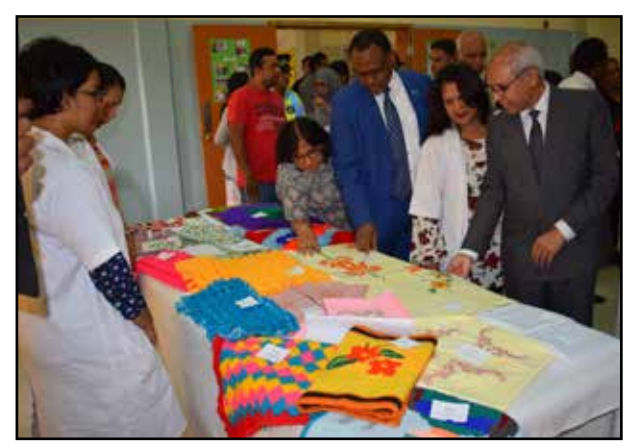
Figure 13 The display of handicrafts made by in-patients of the Mental Health Care Centre during the celebration of the World Mental Health Day 2017 in Mauritius

On World Mental Health Day 2017, WHO Country Representative highlighted the shortage of mental health professionals in Mauritius and drew attention to the WHO Guidelines to support countries in improving and intensifying mental health services and the WHO Action Plan on Mental Health 2013-2020.