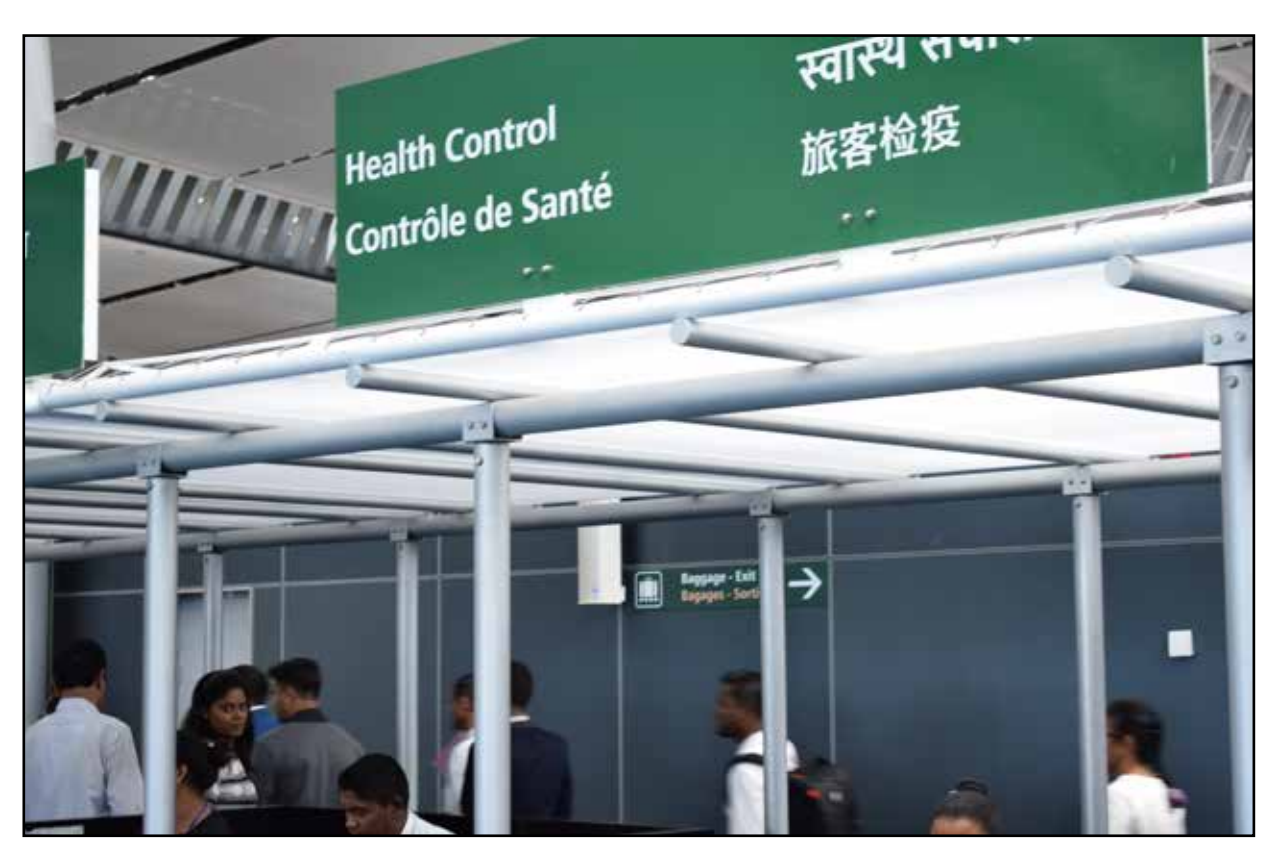
Figure 22 Setting up of a special corridor for passengers coming from Madagascar to prevent plague transmission in Mauritius