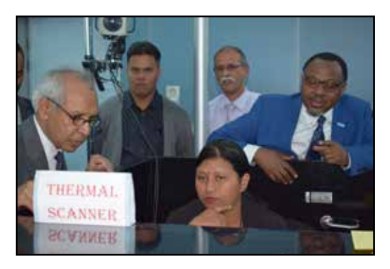
Figure 21 Dr. Hon. A. Husnoo, Health Minister and Dr. L. Musango, WHO Representative ensuring the active surveillance measures were in place at the Mauritius Airport after the reporting of pneumonic plague outbreak in Madagascar

In anticipation of a shortage of IPV in 2017 and to avoid any disruption in the routine immunization schedule, WCO Mauritius assisted MOHQL, through the reimbursable procurement mechanism, to outsource 7,200 IPV doses. In accordance with the Global Action Plan (GAP) for poliovirus containment and End Game Plan, WHO AFRO and IST/ESA fielded a mission to assist the MOHQL in the preparation of documentation of phase 1b poliovirus containment processes for oral poliovaccine (OPV) and Sabin 2 viruses.