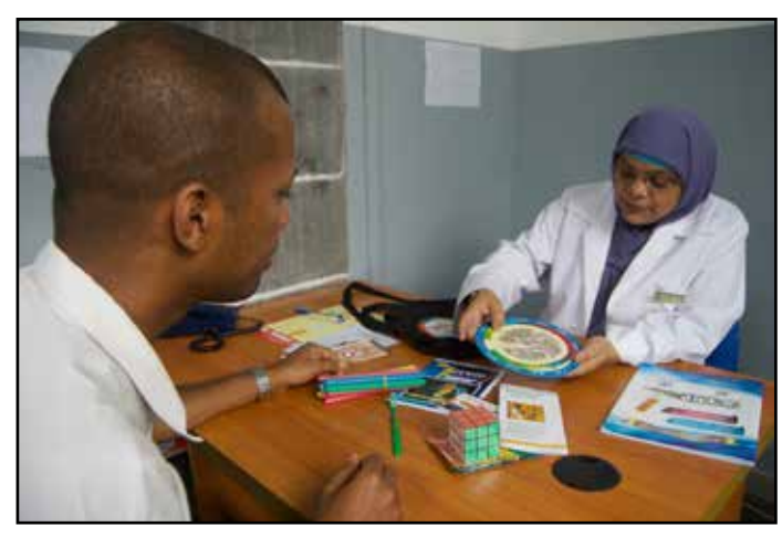
Figure 15 Smoking cessation kits provided to smokers to support their efforts in quitting

Several tobacco control measures have been employed since 2009 to reduce the prevalence of smoking, including the scaling up of smoking cessation clinics (from 1 clinic in 2008 to 6 in 2011) by the MOHQL, a recommendation of the WHO FCTC.