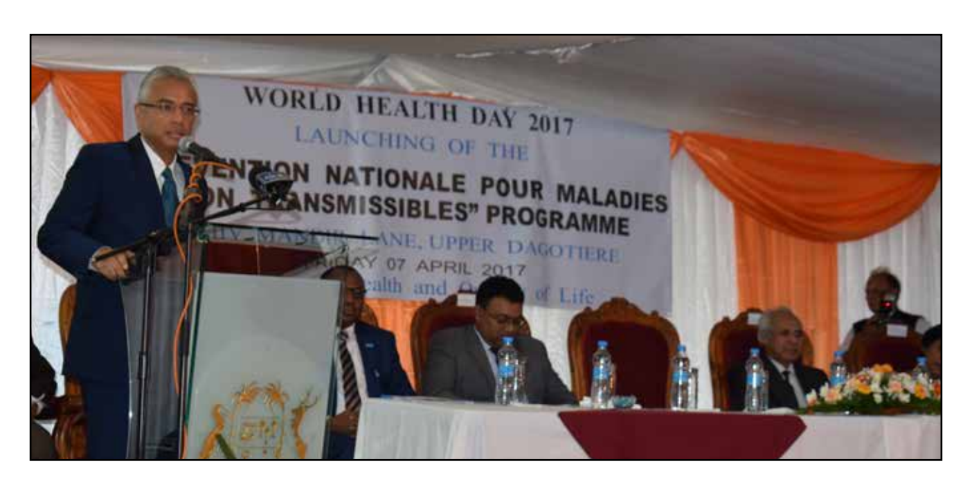
"I am impressed by the work that is being done by social workers and NGOs to combat NCDs. People should take advantage of the services being offered to them freely" – Hon. Pravind Jugnauth, the Prime Minister of the Republic of Mauritius

On World Health Day 2017, the Prime Minister of Mauritius officially launched a national sensitisation campaign to NCDs, in the presence of the ministers of health, education, youth and sport.