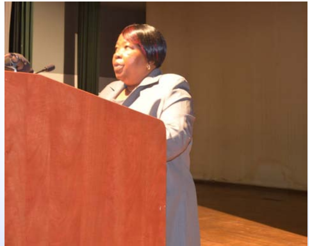
Deputy Minister of Health, Dr. Nthabiseng Makoae presenting her remarks during the celebration.

Speaking at the same occasion, the Honorable Minister of Agriculture and Food Security, Mr. Lits'oane Lits'oane indicated that as the Ministry of Agriculture, they worked in collaboration with the Ministry of Health to celebrate the rabies day to raise awareness about the impact of human and animal rabies and to promote ways of curbing it in animals. He urged the public to work together to fight the disease through adequate animal vaccination and control so that unnecessary deaths from rabies are prevented.