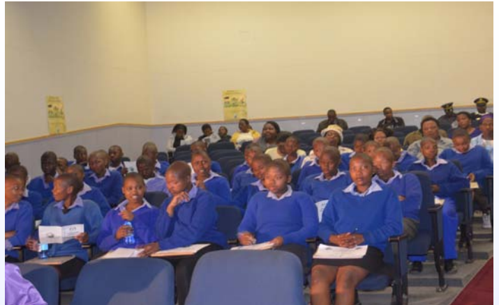
Students listening attentively to the speech.