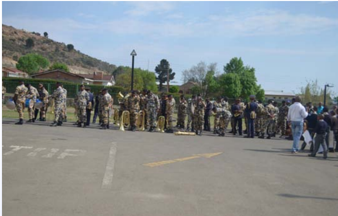
Army band entertaining the crowd.