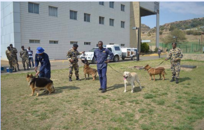
Dogs waiting for vaccination.