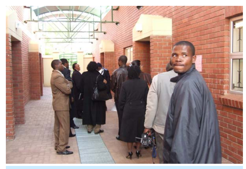
A tour on ART Centre in Scott Hospital in Morija