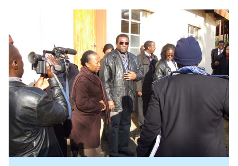
The Regional Director is taken on a guided tour around the School of Nursing in Scott Hospital