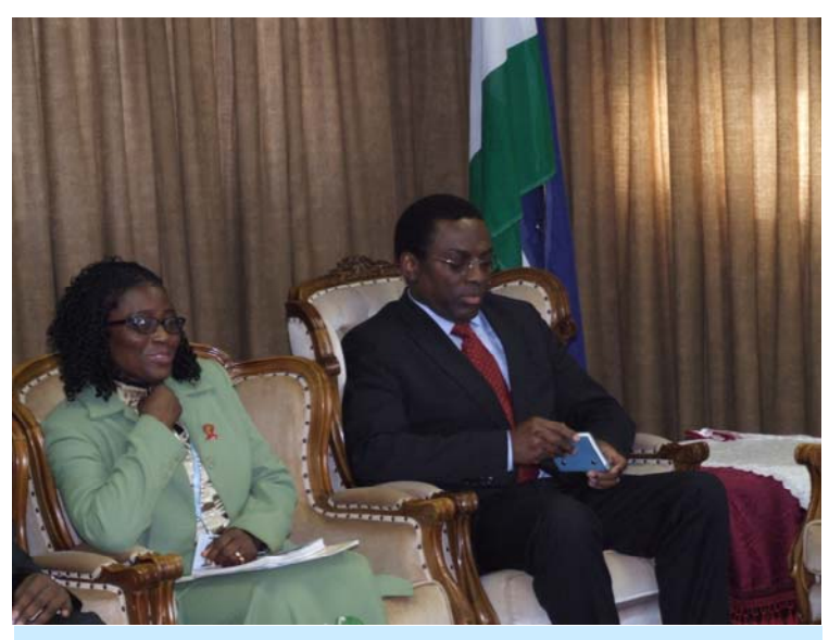
Dr Sambo and WHO Representative on a courtesy call to the Right Hon. Prime Minister