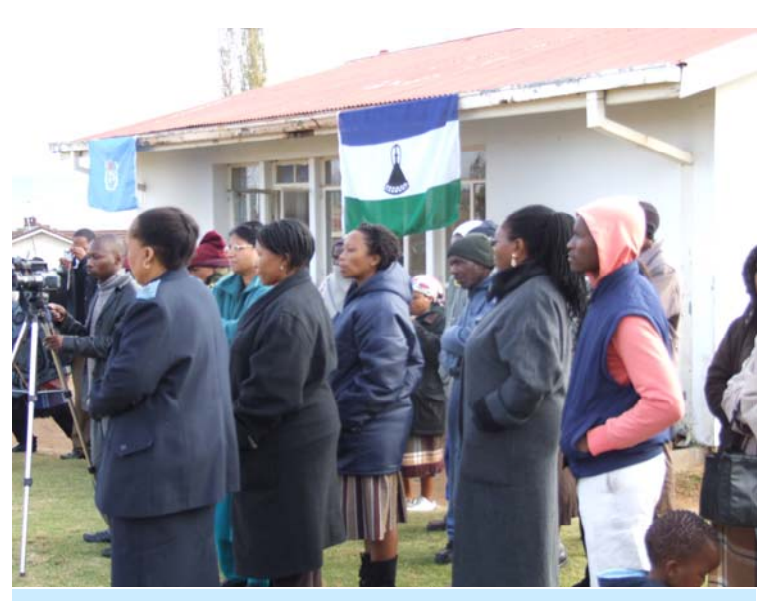
Domiciliary ART center staff listen attentively to the Regional Director remarks on the importance of HIV prevention, care treatment and support