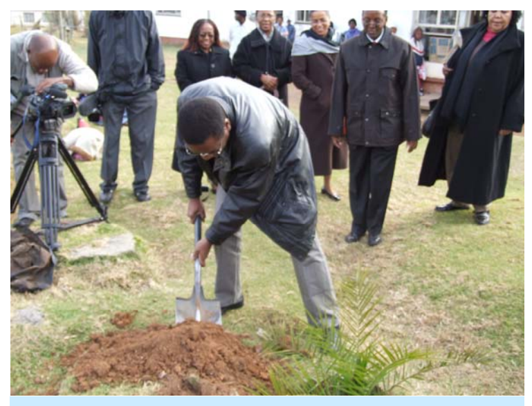
WHO Team and MOHSW senior officials are witnessing an important occasion of tree planting during The Regional Director's to Lesotho