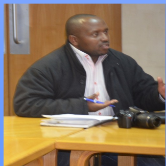
Member of the media asking questions during the press conference.