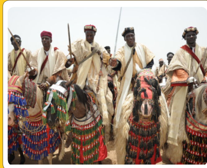
Horsemen from Kanem region of Chad