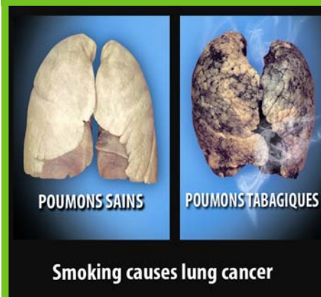
Mauritius health warning