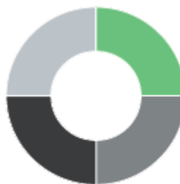
Proportional Mortality in Epi Week 3-2017

■ Malaria ■ Acute Respiratory Infection ■ Acute Watery Diarrhoea ■ Bloody diarrhoea ■ Measles ■ Mental Health ■ Maternal death ■ Neonatal death ■ Other