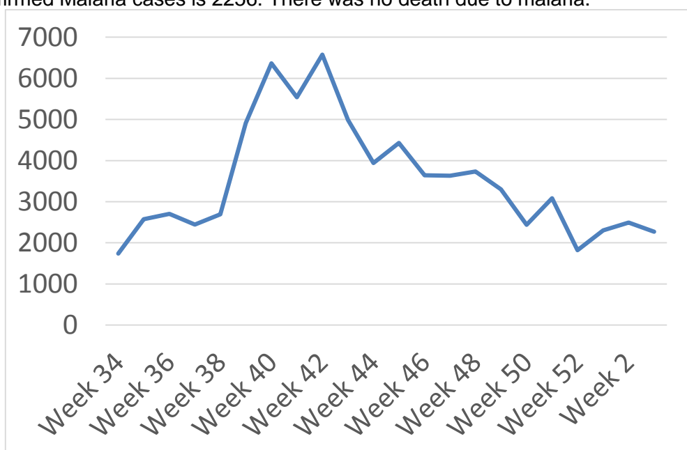
Weekly trend of Malaria cases reported through EWARS in Borno State from Week 34-2016 to Week 2-2017