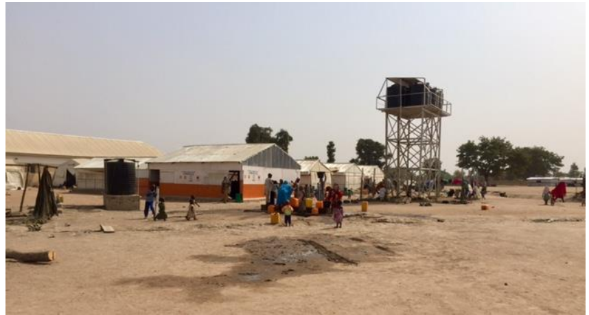
Malkohi IDP Camp in Adamawa State