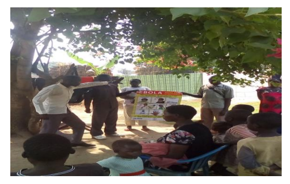
Community sensitization on EVD