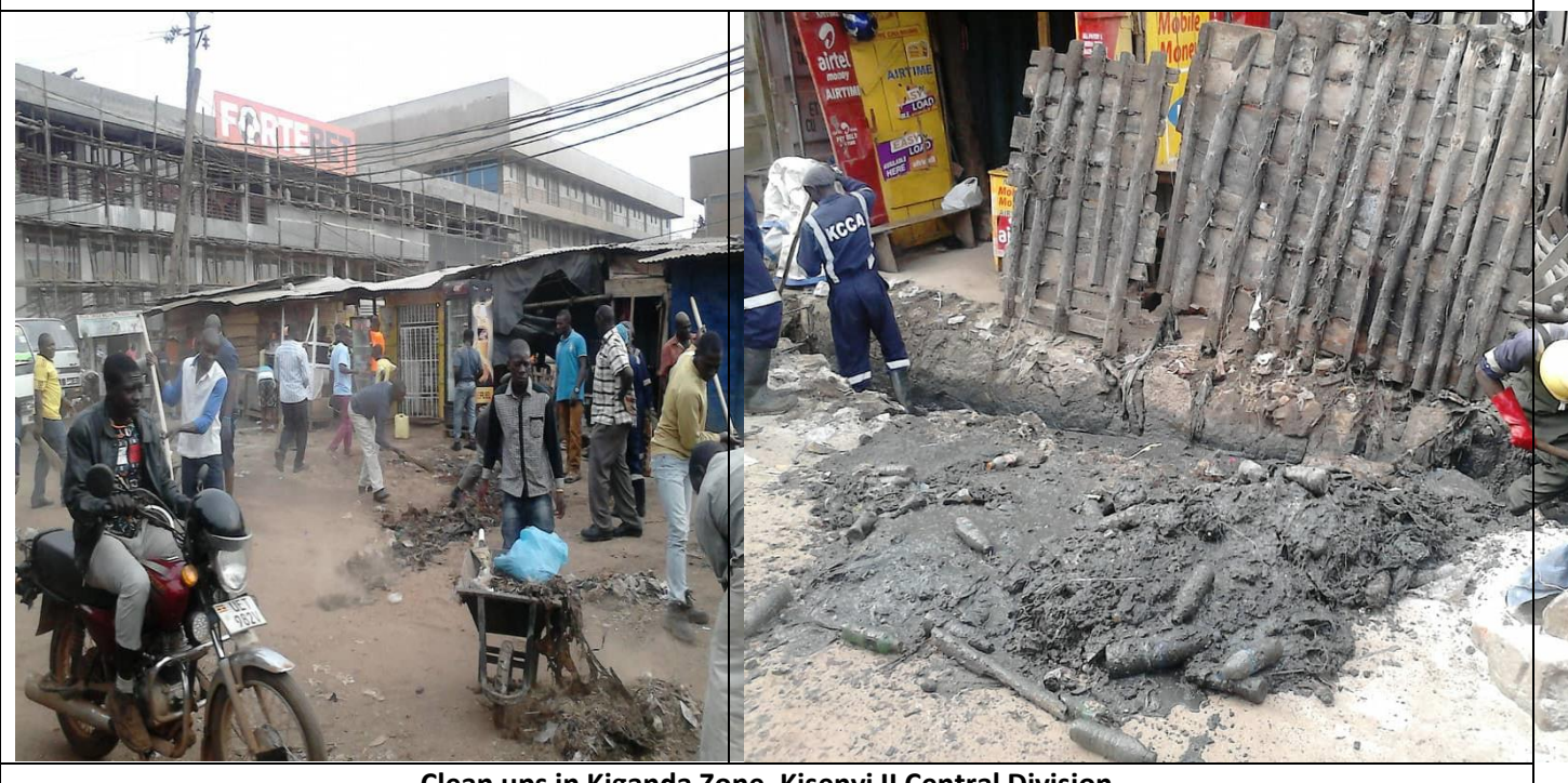
Clean ups in Kiganda Zone, Kisenyi II Central Division