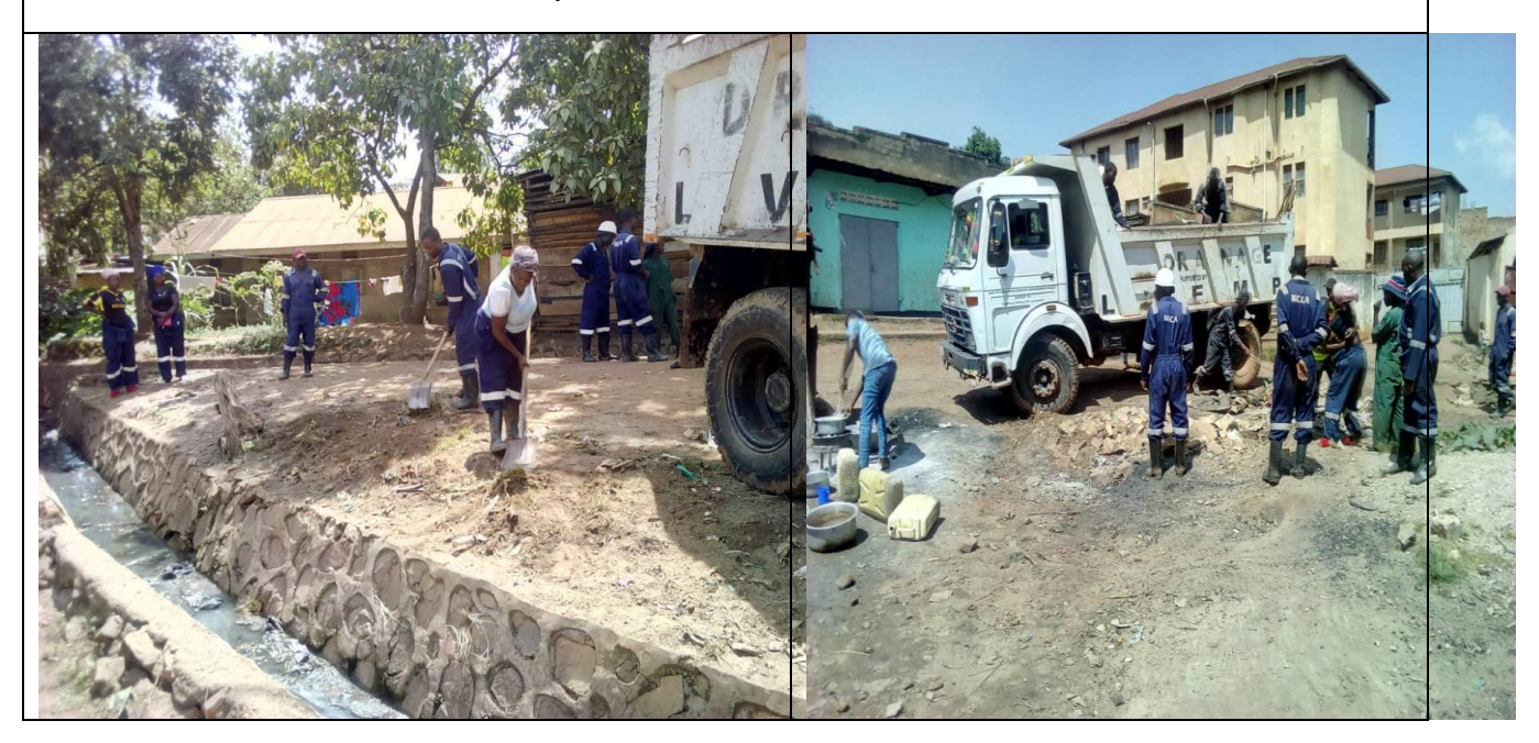
Clean ups in Bukesa Parish Central Division