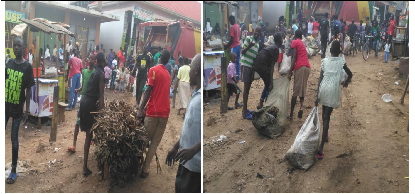
Clean ups in Kiganda and Ssebagala Zones in Kawempe Division