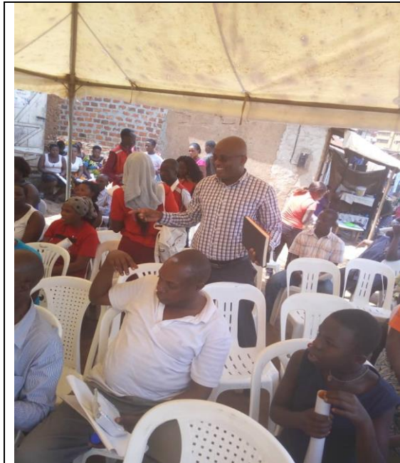
Community Baraza in Katanga Kawempe Division