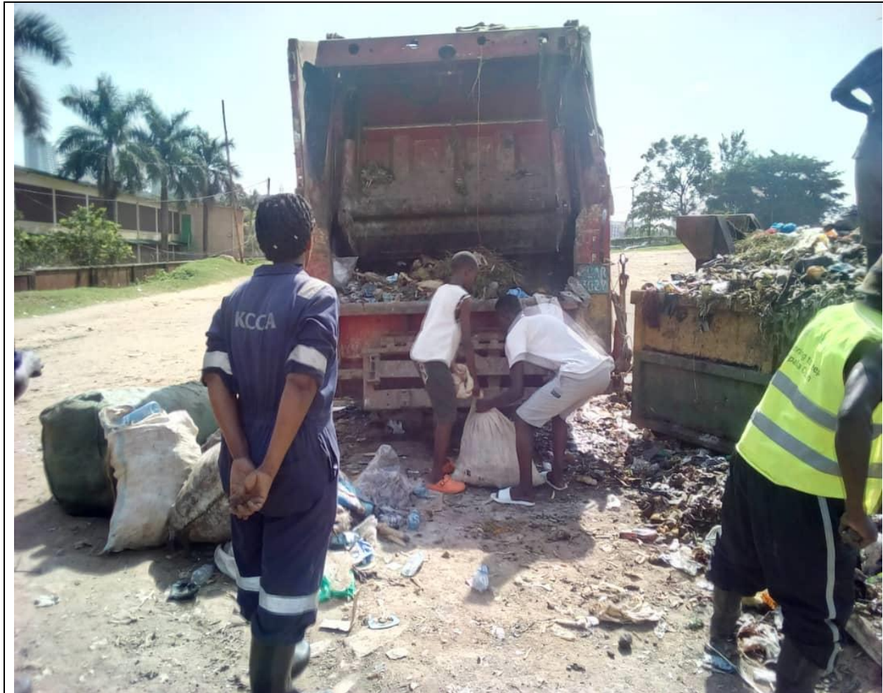
Clean ups in Bukesa Parish Central Division