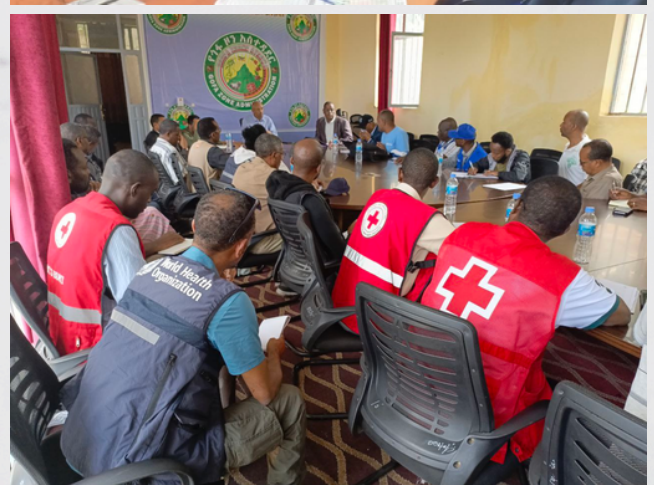
Leadership and regional coordinators meetings.