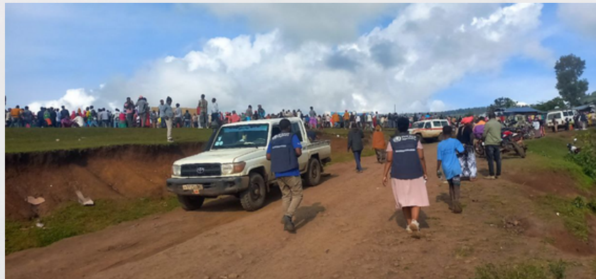
WHO staff on the ground providing vital support to communities affected by recent floods and landslides in Ethiopia