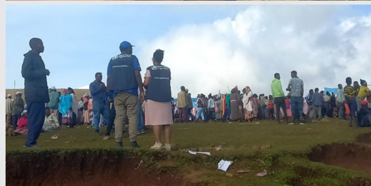
WHO staff on the ground providing medical supplies