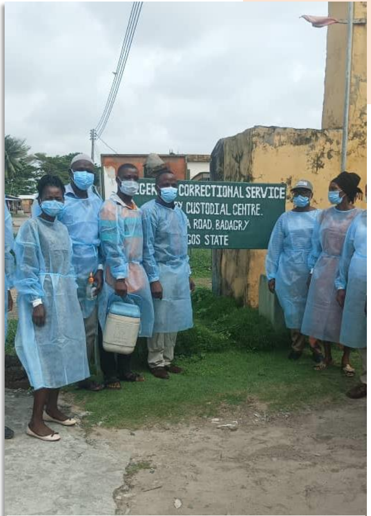
Community teams at one of the correctional centres in the country after collecting samples of cholera.

With at least 22 samples that are yet to be tested, WHO is constantly following up with the National Reference Laboratory (NRL) to ensure the testing is expedited. This will help in improving the quality of the response across the country. Worthy of note, this strategic support from the national, to the state, and the local governments, is not only geared toward refining the overall processes of sample collection, but to boost the turn-around-time (TAT) of the results tested.