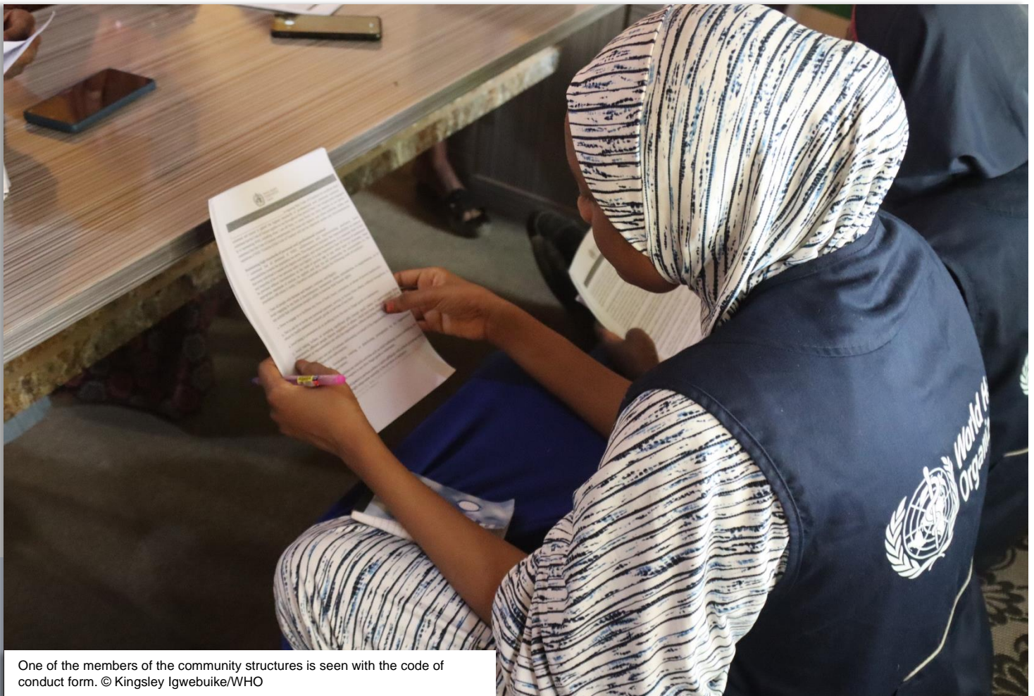
One of the members of the community structures is seen with the code of conduct form.

“Nevertheless, the World Health Organization (WHO) as the global health lead, has re-strategize to ensure the risk of violence during this cholera outbreak across the country is mitigated, including in locations that are hard-to-reach”