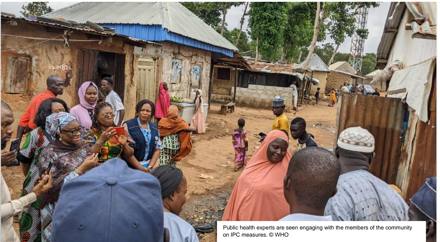
Public health experts are seen engaging with the members of the community on IPC measures.