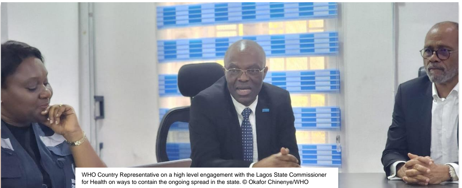
WHO Country Representative on a high level engagement with the Lagos State Commissioner for Health on ways to contain the ongoing spread in the state.

“WHO’s leadership and commitment in ensuring health for all and protecting lives during emergencies and outbreaks is very commendable. Together, we will continue to ensure timely and effective coordination is achieved and vulnerable people have access to the urgently healthcare services they deserve across the state.” – Professor Akin Abayomi, Honourable Commissioner for Health, Lagos State