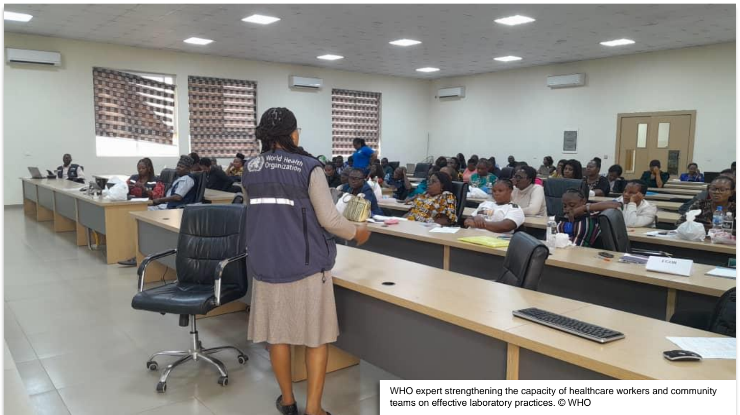
WHO expert strengthening the capacity of healthcare workers and community teams on effective laboratory practices.