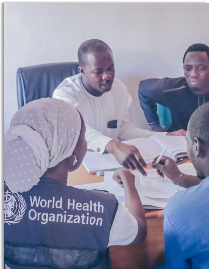
WHO expert providing on-the-job mentoring on strategies effective documentation and community case search.