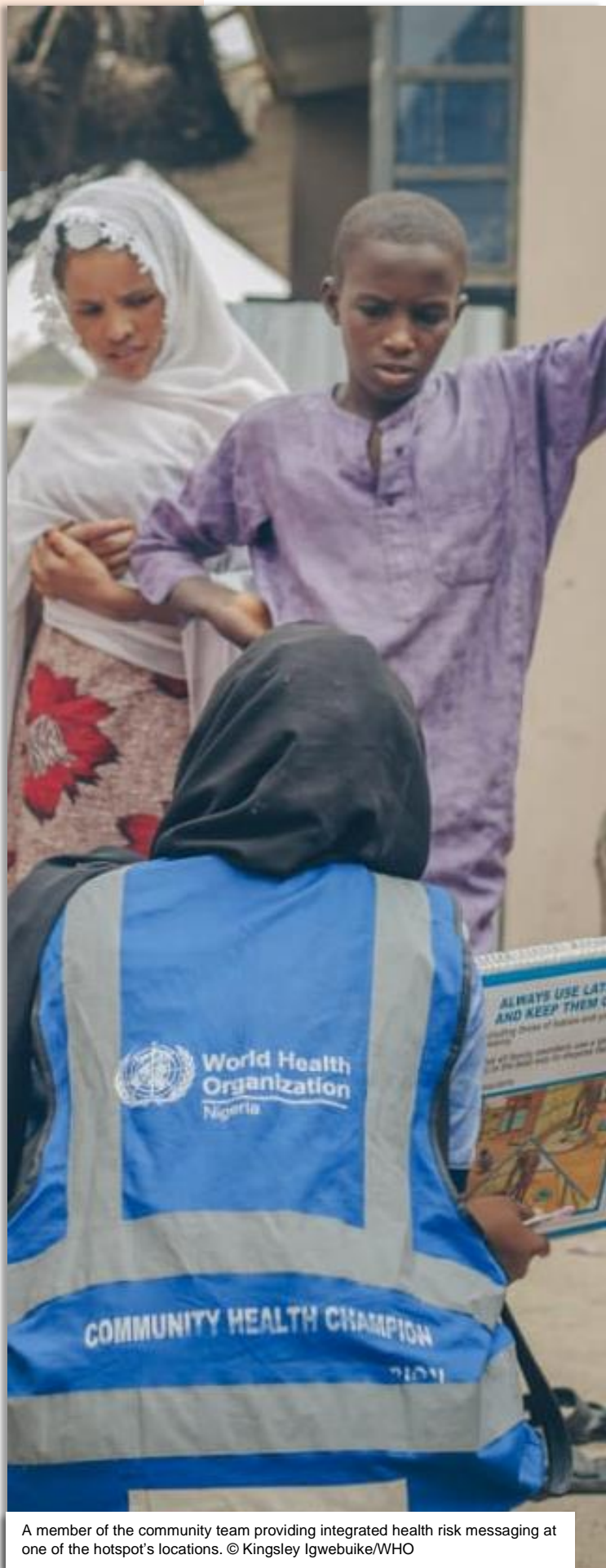
A member of the community team providing integrated health risk messaging at one of the hotspot's locations.

As of epi-week 28, at least 150,000 persons have been reached with preventive messages through the house-to-house strategy. These persons were reached using structures such as the Community Champions, Field Volunteers, and the local government facilitators. The team also found and referred more than 50 suspected cases of cholera through the disease surveillance and notification officers for proper management and documentation. Mass media awareness creation is also another strategy (e.g. motorized campaign, airing of radio spots, town announcement) leveraged to reach vulnerable persons with risk messaging. Currently, more than 5 spot announcements are being aired daily, across predominant radio stations on the prevention of cholera across the hotspot states in the country. Additionally, WHO is providing technical support to ensure advocacies to traditional, religious and community leaders are utilized to increase awareness and to encourage ownership of the overall response in the country. So far, 15 advocacy visits have been conducted across the hotspot states.