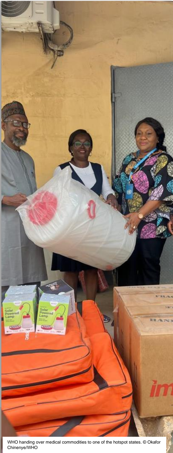
WHO handing over medical commodities to one of the hotspot states.

Operations support is a critical area the World Health Organization (WHO) is maximally utilizing, to ensure seamless, timely, and efficient support is provided to the states through the Federal Government. This includes the donation of medical consumables and deployment of national rapid response teams to the hotspot's states. Currently, WHO has supported the deployment of 12 response teams to support key thematic areas such as case management, and health information management (HIM)/surveillance). In addition, WHO has donated medical items to states such as Lagos state. At least 35 essential emergency community and periphery cholera kits were donated to the state. These kits have the capability of treating more than 5,000 vulnerable people who are affected by the outbreak. Finally, the logistics from the ward level, up to the state and national is being strengthened to ensure overall efficiency, especially the transportation of cholera samples.