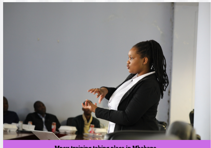
Mpox training taking place in Mbabane