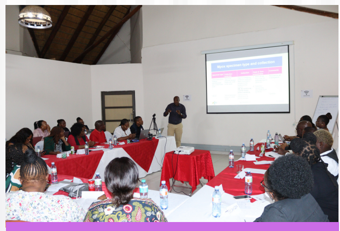
Training of Trainers on Mpox taking place in Ezulwini

Mpox remains a notifiable disease which is part of the 13 public health threats that are being monitored through the weekly surveillance system in the country.