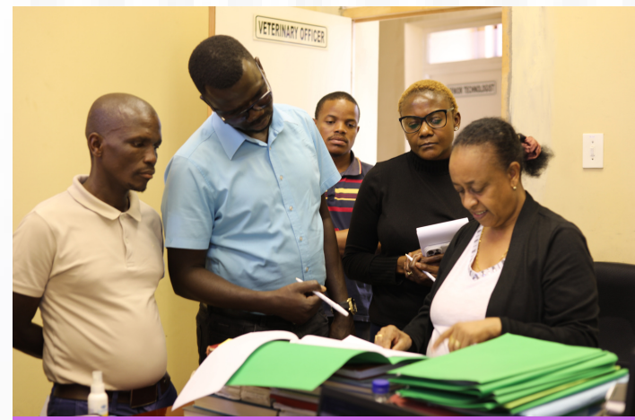
The team also visited the Veterinary Services where they reviewed important documents guiding the operations at the centre

He further outlined the strides made to improve the country's preparedness and response to emergencies since the last JEE. In April 2020, in response to the COVID-19 crisis, the World Bank approved a US$6 million loan for Eswatini to support the implementation of the COVID-19 National Emergency Response and Preparedness Plan through the COVID-19 Emergency Response Project. The project development objective was to prevent, detect and respond to the threat posed by COVID-19 and strengthen national systems for public health preparedness in Eswatini. Additional funding of US$8 million, comprising a US$5 million loan from the International Bank for Reconstruction and Development (IBRD) and a US$3 million grant from the Health Emergency Preparedness Trust Fund (HEPRTF), was approved in April 2021 to support the expansion of activities under the COVID-19 Strategic Preparedness and Response Plan, using the Multiphase Programmatic