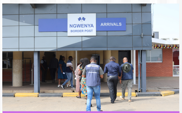
The external and internal team entering the Ngwenya Border Post during the

"I would like to commend the government of Eswatini for its dedication to safeguarding the health and well-being of Emaswati. This commitment is evident through the adoption of the IHR Monitoring and Evaluation Framework (MEF), which guides the assessment of progress in health security. I also commend the Government's consistency in monitoring the core capacities under the IHR using standardized tools such