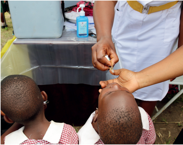
Children getting immunized by a medical nurse in Mbale District.