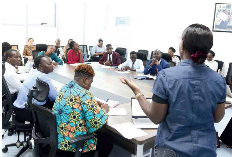
The WHO and MoH team addressing youth champions at the WHO Country Office

As part of a broader strategy to protect young Ugandans from the dangers of New and Emerging Nicotine and Tobacco Products (NENTPs), the Ministry of Health (MoH), supported by the World Health Organization (WHO), held a 2 day groundbreaking workshop in Kampala bringing together student leaders from seven Universities in Uganda to discuss the enforcement of Uganda's Tobacco Control Act 2015, control of tobacco-related harm & its control which includes a ban on NENTPs.