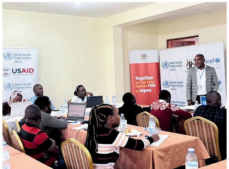
Journalists attending an orientation session conducted by WHO, Unicef and partners

While mpox remains a significant public health concern in Uganda, the country has made significant strides in responding to the outbreak. WHO, with support from partners like the United States Agency for International Development (USAID), is working diligently to strengthen the different response pillars; coordination, surveillance, laboratory diagnostics, case management, risk communication and community engagement countrywide. More info