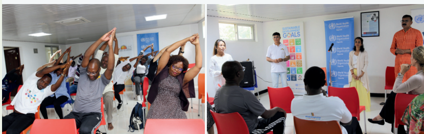
UN in Uganda Staff participants during the commemoration of WorldMeditationDay2024