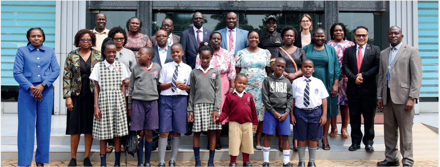
Members of the Uganda Parliamentary Forum on Malaria and NTDs , including 10 Members of Parliament, Children Ambassadors, and WHO team to strengthen partnerships for malaria elimination in Uganda.

We extend our sincere appreciation to all our partners who have contributed to our work in supporting the Government and the people of Uganda. We rely on your continued support and collaboration in ensuring the continuity of essential health services, improving the health and well-being of people, and responding to the most urgent needs of the health sector. We can only meet our goals through the power of partnership.