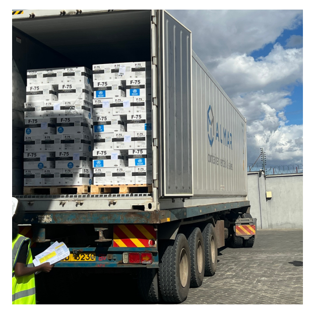
A truckload of medical supplies is being dispatched from the Regional Emergency Hub deport to the counties

The 25 beneficiary counties encompass a diverse geographical spread, including Lamu, Garissa, Mandera, Tana River, Marsabit, Nairobi, Kiambu, Kilifi, West Pokot, Turkana, Isiolo, Kajiado, Busia, Bungoma, Kwale, Siaya, Kisumu, Nyandarua, Homabay, Kitui, Migori, Mombasa, and Trans Nzoia.